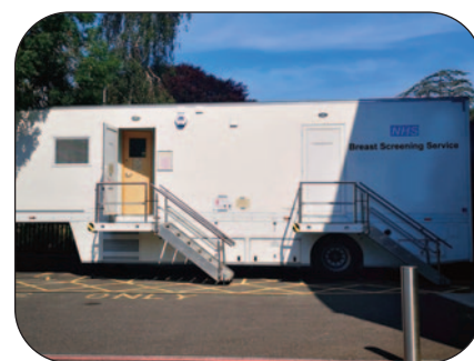
Mobile Breast Screening Unit

there MUST be a suitable bay (with the requisite 'plumbing') for the breast screening unit - a bay which could double as a site for the widely used mobile MRI and CT scanners and would allow diagnoses to be made without the need for patients to travel long distances - was also ignored.